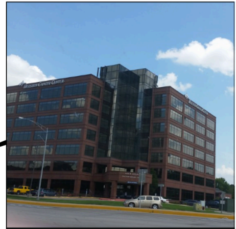
Hulston Cancer Center - 7th Floor 3850 S. National, Ste 705 SGF MO 65807