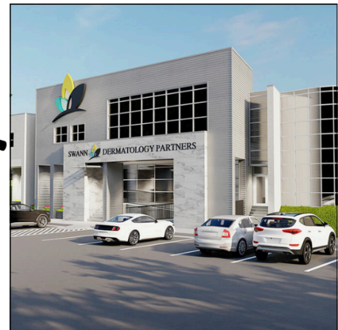
Springfield-Independence 1240 E. Independence, SGF MO 65804